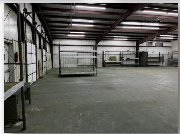
FOR ADDITIONAL INFORMATION PLEASE CONTACT